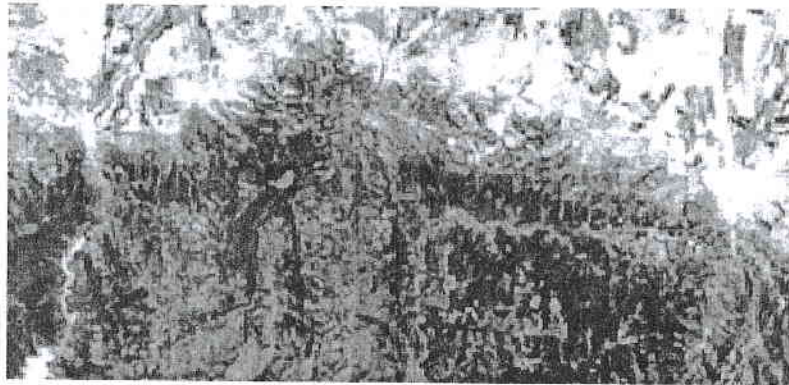
Fig.2 NDVI for vitality assessment of the selected regions